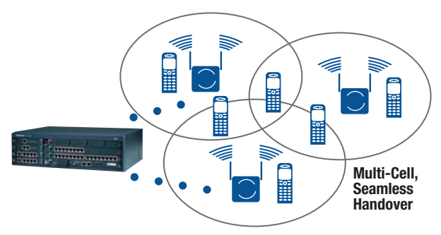
NCP supports Wireless Telephone Integration

Communication Assistant – intuitive PC-based application suite which includes voicemail integration